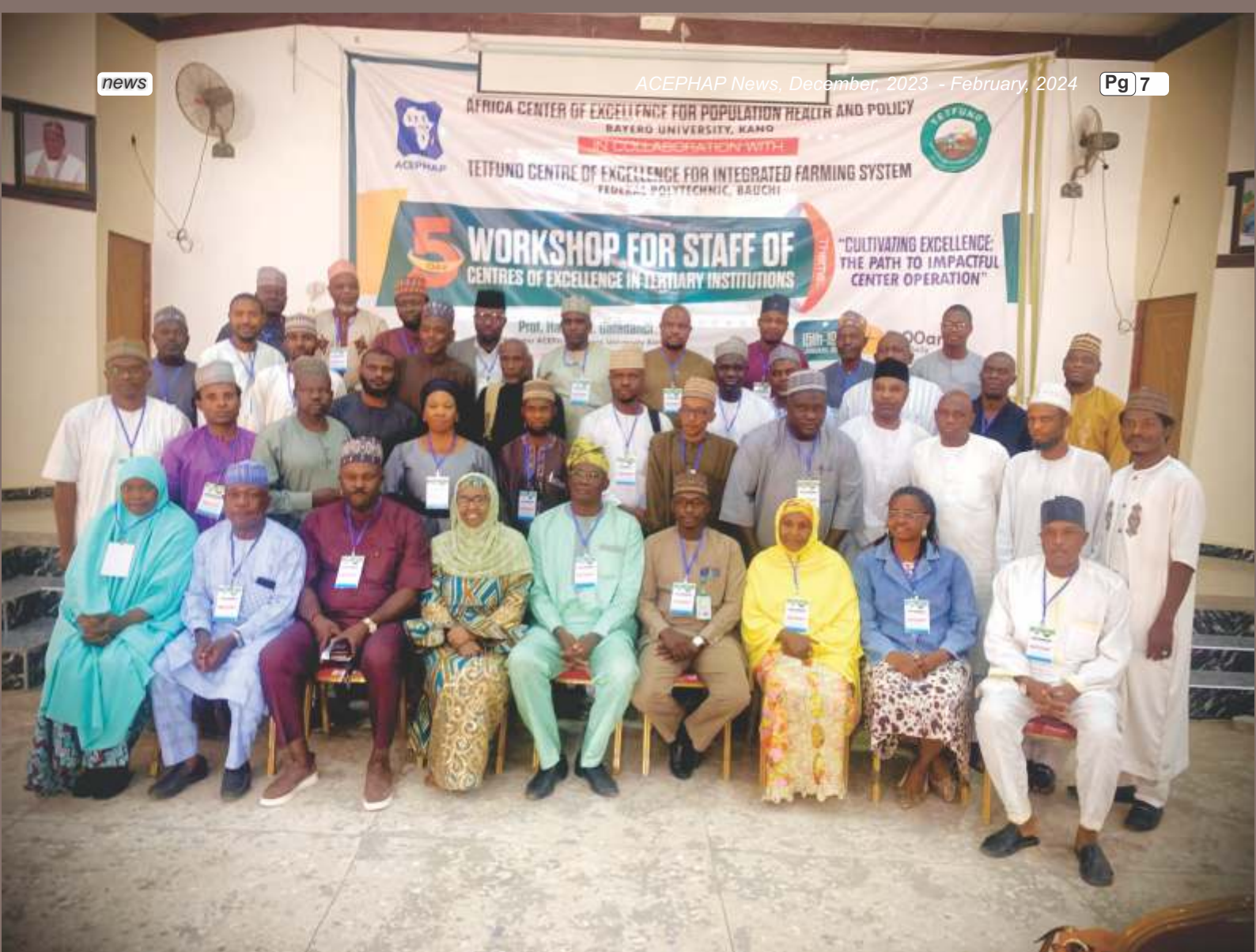
Participants in a group photograph

to learn and replicate the success story of ACEPHAP.