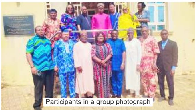
Participants in a group photograph