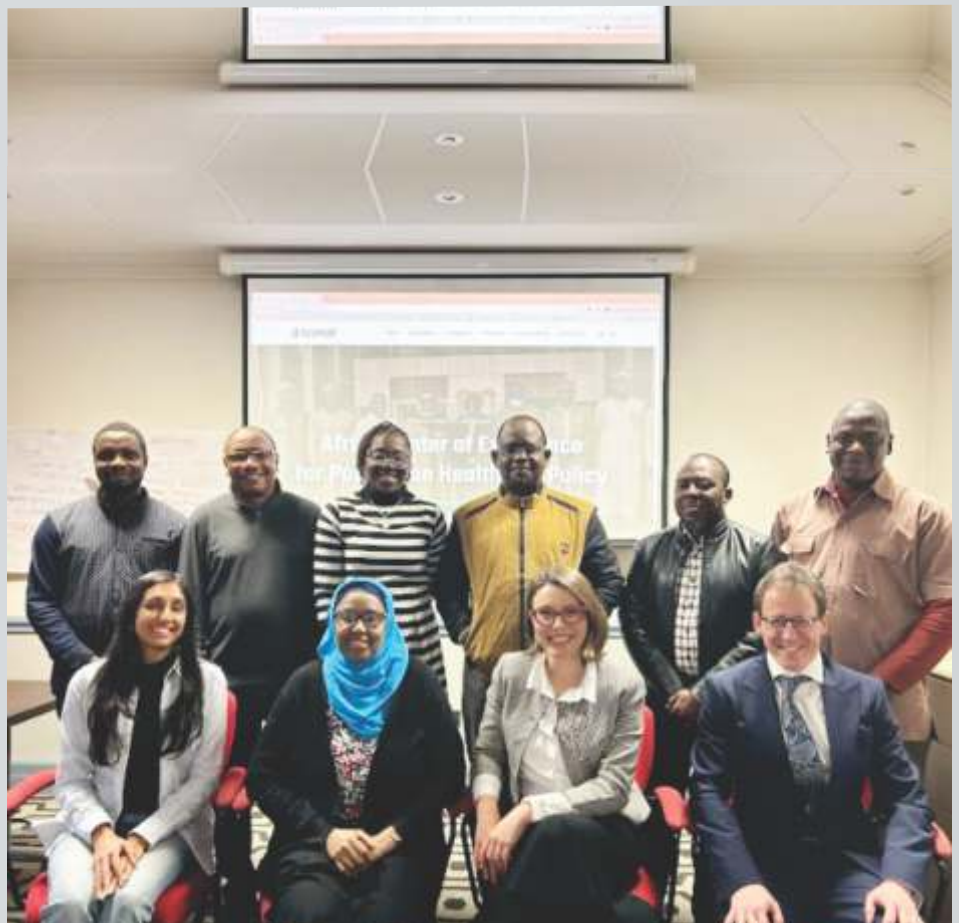
ACEPHAP Team in a group photograph with Research Retold group after the workshop