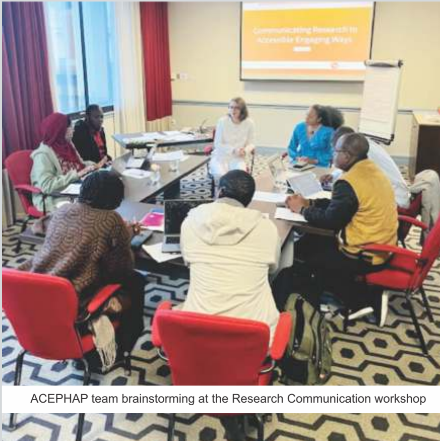
ACEPHAP team brainstorming at the Research Communication workshop

Research Retold has collaborated with more than 1000 researchers across 25 UK universities