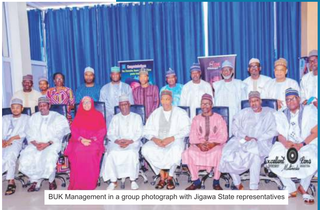
BUK Management in a group photograph with Jigawa State representatives