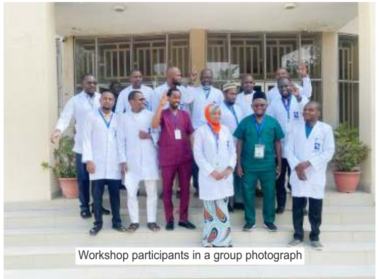
Workshop participants in a group photograph