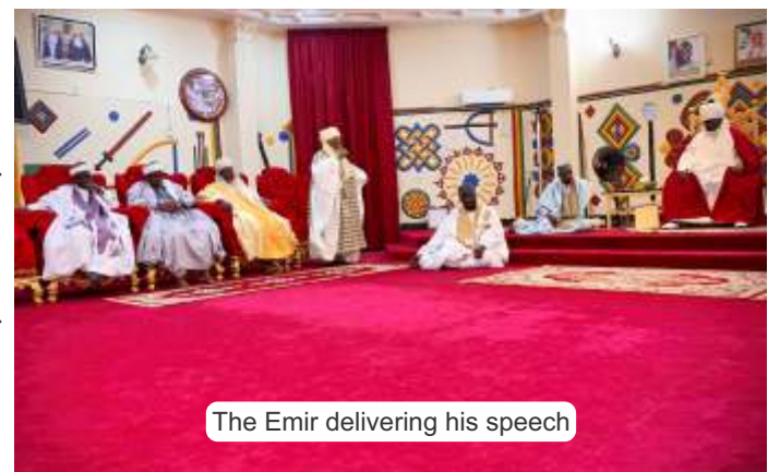
The Emir delivering his speech

signed a memorandum of understanding with the Jigawa State Government on maternal, child health and nutrition as well as to increase the capacity of their healthcare providers to ensure they provide quality emergency obstetric care services through training. “We hope to exploit similar opportunity here in Bauchi for the purpose of improving the knowledge of healthcare providers for the betterment of the citizenry.