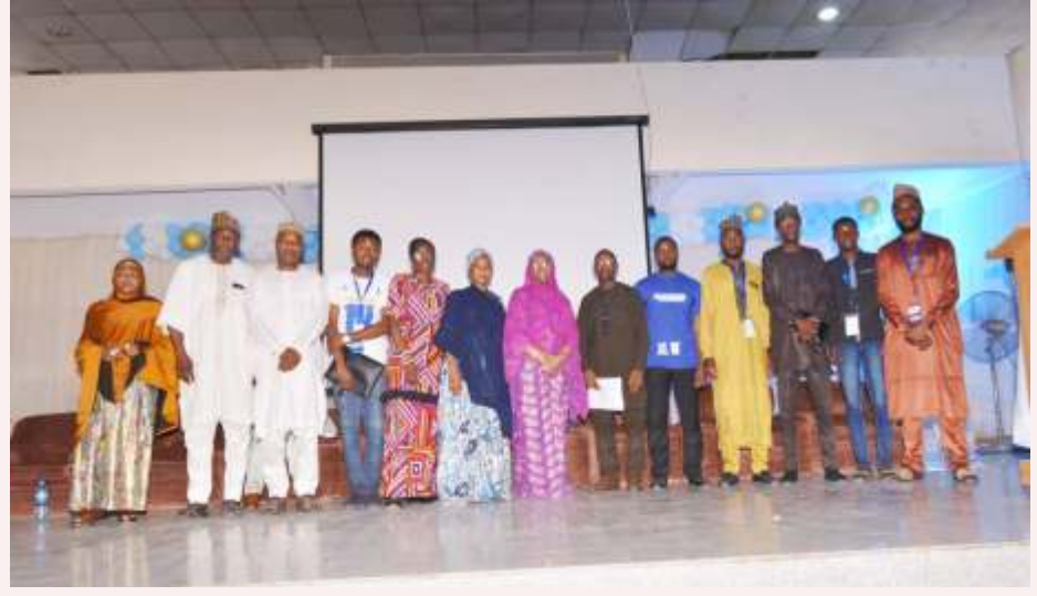
Health innovation week LOC in a group photograph