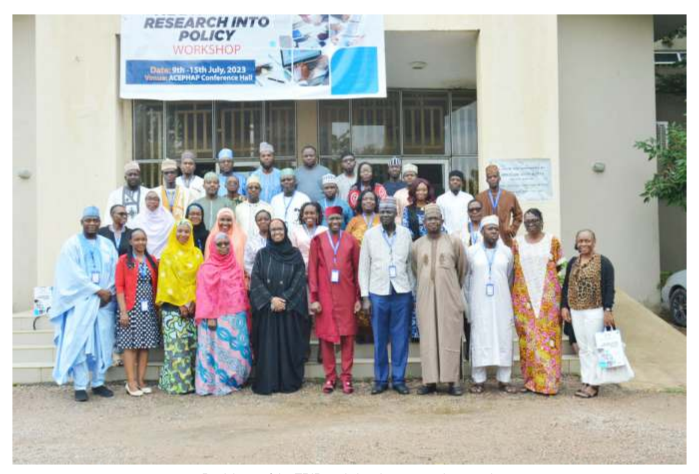
Participant of the TRIP workshop in a group photograph

ne of the major challenges of Researchers in Africa had been how to translate research findings into policy to benefit humanity. This challenge had made it almost impossible Africa to drive the maximum benefit of research findings. For this reason most research findings had been left to rot on the shelves.