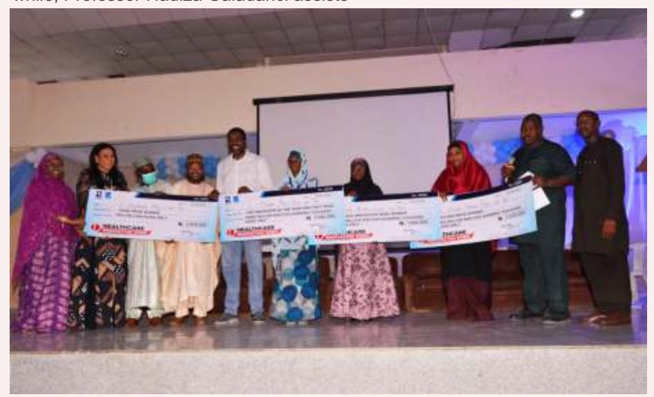
The pitch competition winners displaying their prizes