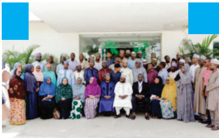
Participants in a group photograph after the workshop