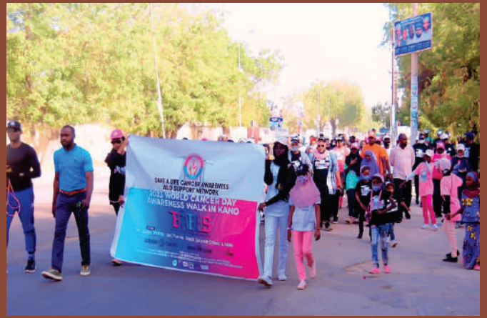
Awareness walk to commemorate cancer day