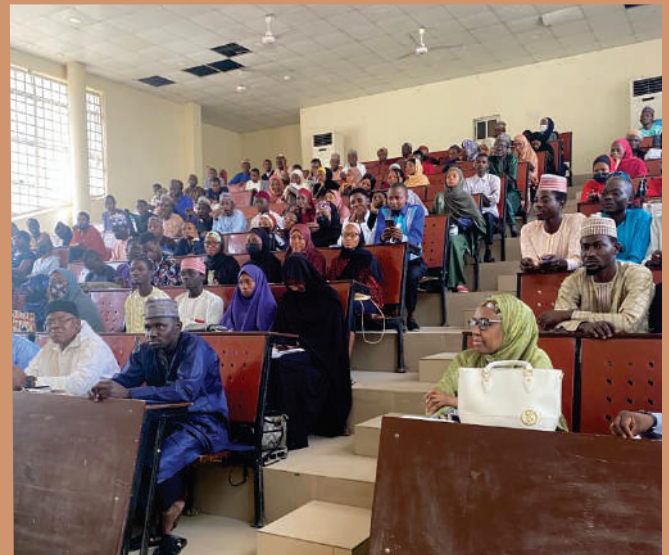
Students using the new furniture provided by ACEPHAP