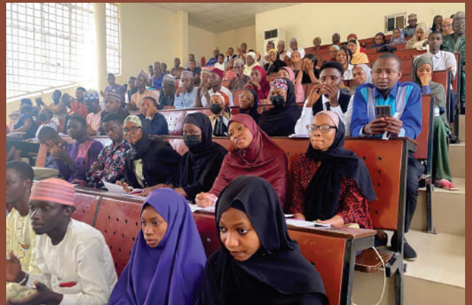
Students using the new furniture provided by ACEPHAP