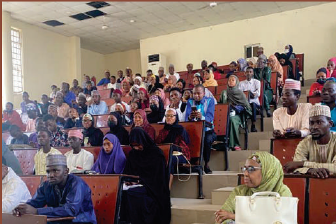
Students at a lecture theatre