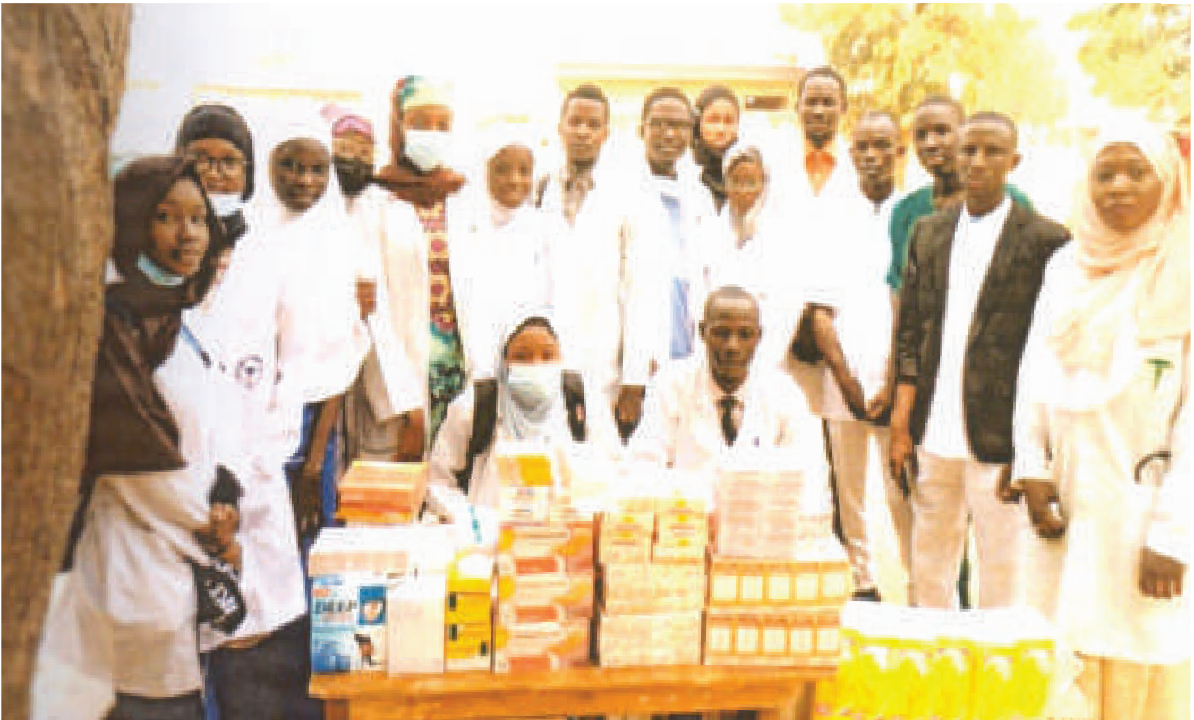
Nurses and Midwives in a group photograph during the outreach campaign