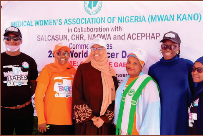
Dignitaries at the world cancer day celebration