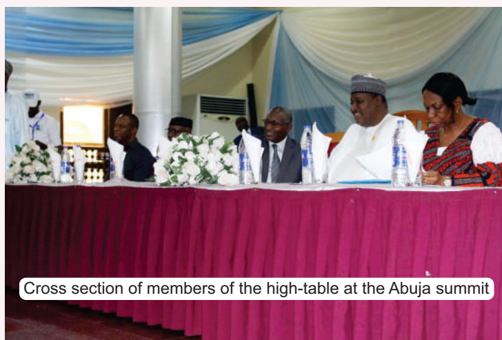
Cross section of members of the high-table at the Abuja summit

She said to reduce to the barest minimum the rising incidences of high maternal mortality, health care providers, civil societies and community/traditional and religious leaders need to embark on raising awareness on the importance of anti-natal