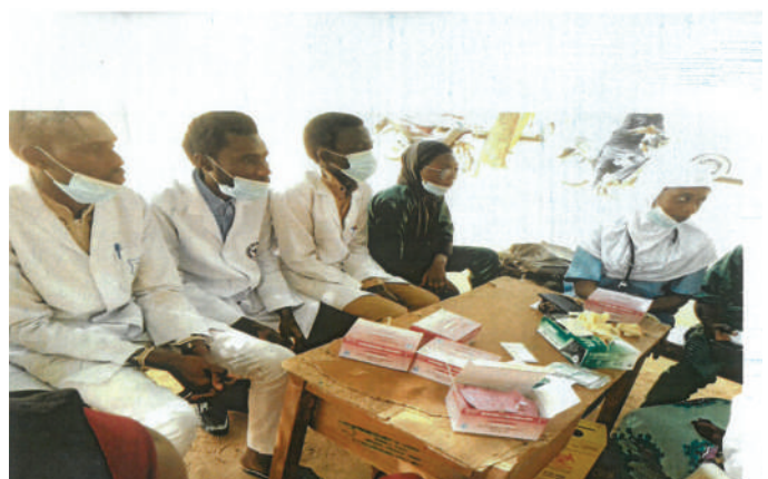
Medical check-up being conducted to the participants

They also benefitted from health education on the recent outbreak of diphtheria. Over 150 females benefitted from the free sanitary pads disbursement.