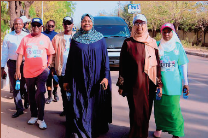
Cancer awareness walk