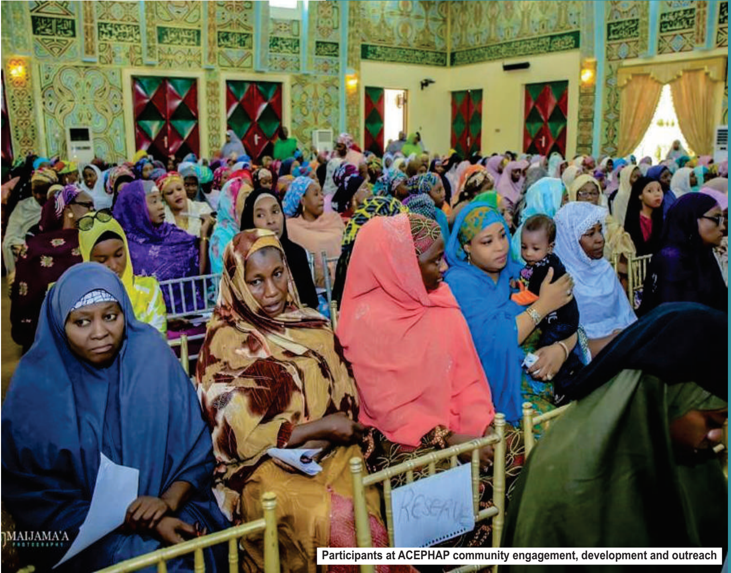
Participants at ACEPHAP community engagement, development and outreach

The last quarter of the year 2022 was not only hectic for the Africa Centre of Excellence for Population Health and Policy (ACEPHAP) team, it was also activities personified. The numerous activities that took place in the Centre spanning three months – September, October and November were part of the concerted efforts of the Centre Management Team to execute the mandate of the centre in line with the dictates of the World Bank grants. Impactful research, postgraduate training, collaboration and short course trainings are some of the core mandates of the World Bank ACE grant. It should be noted that ACEPHAP research focus is centred on achieving Sustainable Development Goal (SDG) 3, which focuses on maternal health, child health nutrition, infectious diseases, non-communicable diseases, as well as mental health. The centre can boast of experts in all these fields.