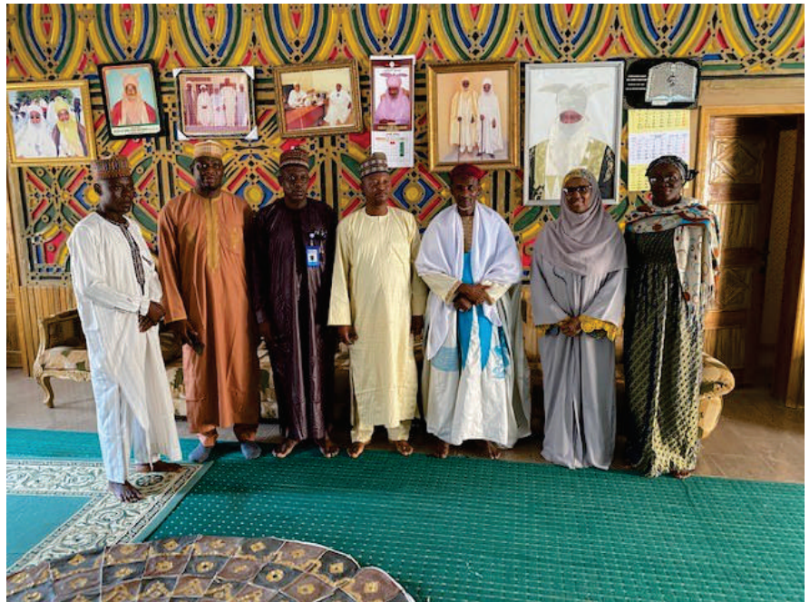
Traditional Homage by ACEPHAP team

She assured that the centre would continue to organise training workshops aimed at building individuals' capacity to be better administrators.